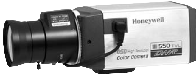
Lens Sold Separately

DNR Color Camera, Super HAD, 0.002 lx, 550TVL, PAL